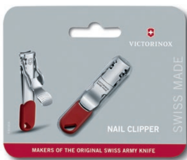
8.2050.B1 Nail Clipper, red, in blister