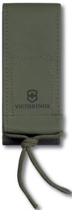
4.0838.4 Leather imitation belt pouch