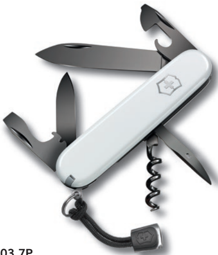
1.3603.7P Spartan PS, white