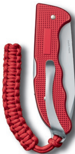
4.1875 Paracord pendant