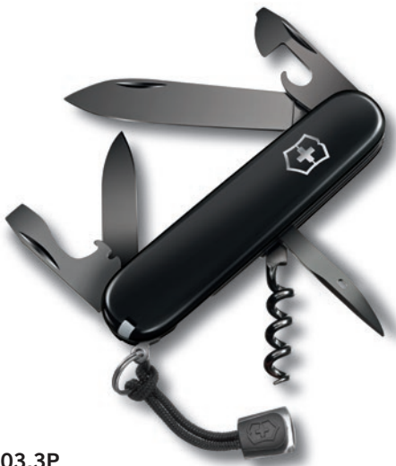
1.3603.3P Spartan PS, black