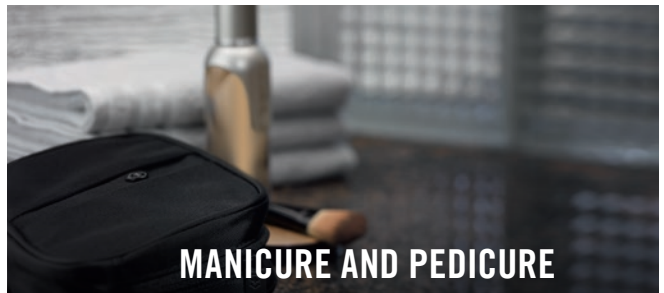
MANICURE AND PEDICURE