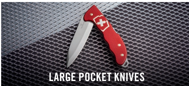
LARGE POCKET KNIVES