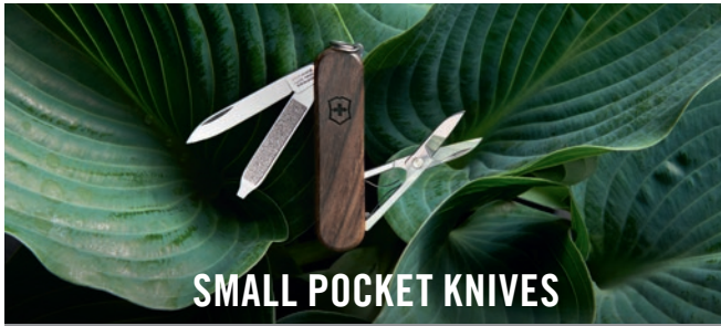
SMALL POCKET KNIVES