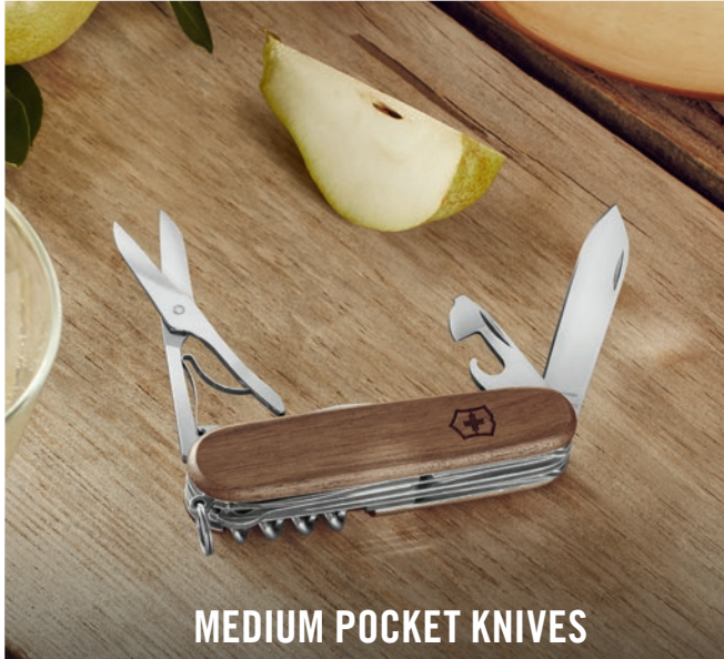
MEDIUM POCKET KNIVES