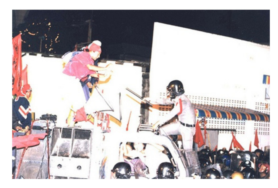
Figure 8. Confrontation between local protestors and police regarding the development of Chana Power Plant and its effect on the environment