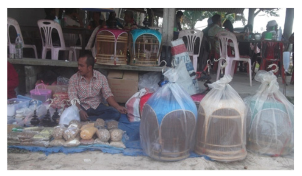
Figure 3. A bird breeding accessory trader selling goods at the dove-cooing competition