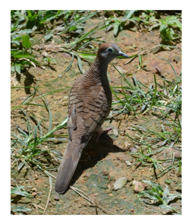
Figure 1. A wild zebra dove

The sound of the zebra dove carries a special meaning in all corners of Chana society. The birds were first captured from the forest by trapping, beating and baiting (Figure 1). The birds were kept as pets to add to the ambience of the home with their call and as symbols of good luck and prosperity (Hassan Niyomdecha, personal communication, 2011). The birds were then used by local businesses, such as tea houses, to provide a pleasant atmosphere and background noise for their customers. Although there had been small local contests throughout history, the first organized birdsong competition in Chana was in 1977 (Kan Kongthong, a local villager, personal communication, 2011). From the humble beginnings of small village gatherings, the birdsong competitions are now staged at an international level. The development of competitions sparked the phenomenon of zebra dove breeding at homes and on farms, which significantly altered the local lifestyle, economy and the importance of the zebra dove to the community (Teerapong Donsri, personal communication, 2010). The zebra dove is important to Chana beliefs, economy and society.