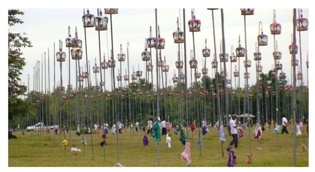
Figure 4. The field of competitors during the dove cooing competition