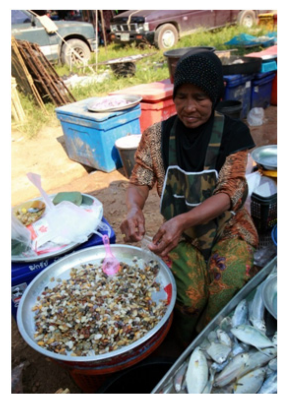
Figure 7. A local market trader commenting on the effects of the Chana Power Plant

Local people believe that the IMT-GT caused widespread environmental changes in and around Chana. This local market trader (Figure 7) said that the big sea fish and shrimp had disappeared since the power plants had been constructed (Anonymous, personal communication, 2010). This observation was confirmed by Kan Kongthong: 'marine and freshwater animals, such as shrimps, shellfish, crabs and fish, all died. There was also noise pollution and the temperature was unusually warm' (personal communication, 2010). Abdulraman Senair (personal communication, 2010), who lives close to the gas separation plant in Ban Talingchan, told how residents were reluctant to eat locally cultivated produce, which grew deformed and diseased. The construction and operation of the two plants had, at the very least, a perceived affect on the people, their environment and their birds.