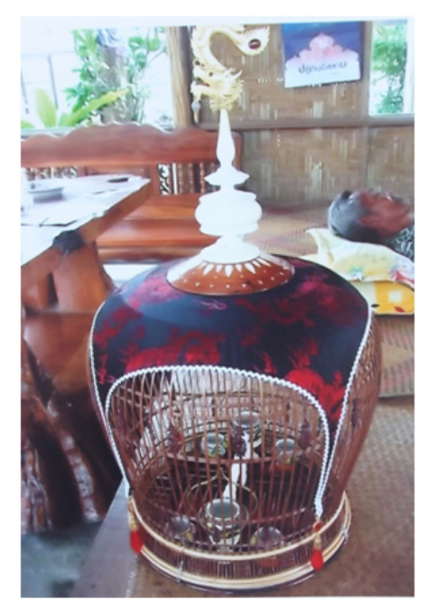
Figure 5. A cage made by Prasit Saeng-nikoon

Cage production and sale is a large part of the zebra dove economy. 'For zebra doves to be in good condition and have a high price, they must be kept in beautiful cages' (Roman Kreeda-o, personal communication, 2011). 'The best birds should be in the most expensive cages. They can earn up to 10 million baht for their owners so they should live in high quality cages made from the choicest materials (Figure 5)' (Prasit Saeng-nikoon, personal communication, 2011). Given the importance of the cages, a production group has been established with Roman Kreeda-o as its chairman 'to inherit and transmit the traditional knowledge of cage production and ensure the value of zebra dove cages is maintained and developed to the same extent as the birds' (Roman Kreeda-o, personal communication, 2011). The price of the cage is determined by the appeal of the design, the quality of the handiwork and the rarity of the materials, which include precious stones (Paisin Kaewmahakan, personal communication, 2011). Cage prices range from a few hundred baht to over a million baht. The breeders pay close attention to every aspect of the zebra dove environment; even the cage cover is woven from imported fabric from Malaysia and Singapore (Wilaiwan Chotsair, personal communication, 2011). Yet, as the following quote reveals, there is a fine line between the zebra dove economy and the zebra dove philosophy.